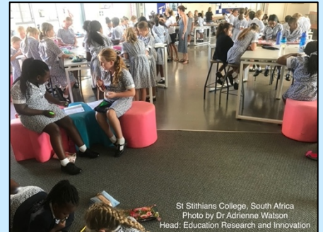
St Stithians College, South Africa